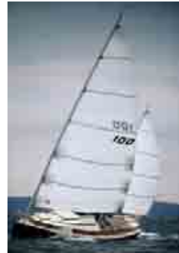
The catalyst for our friendship. Sailing Norwalk Islands Sharpies. Image Margo Kirby.