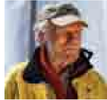
As the sailor in later years.